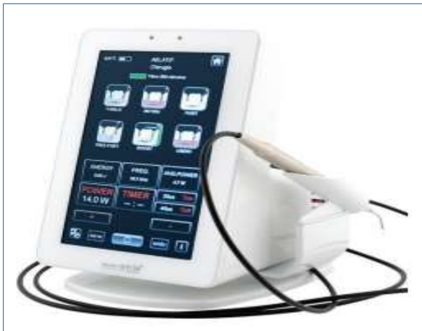
Fig-1: Example of diode lasers