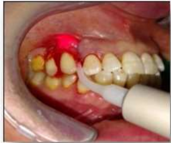
Fig-8: Laser application