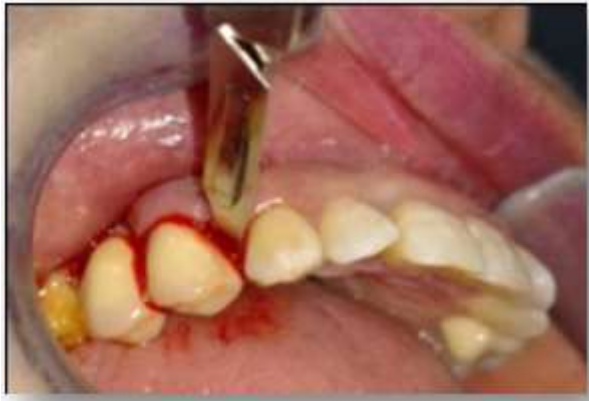
Fig-5.a: Incision of the lesion with a scalpel