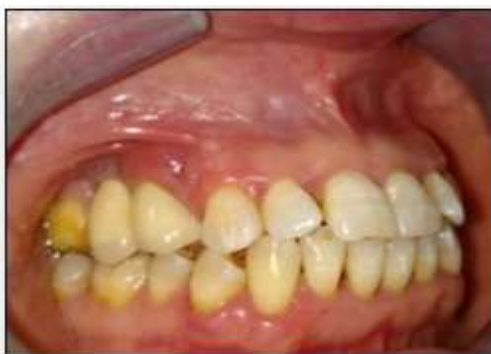
Fig-4.a: Clinical manifestations of tissue inflammation in relation to the 14 and 15.