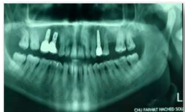
Fig-4.b: Bone lysis around the two implants