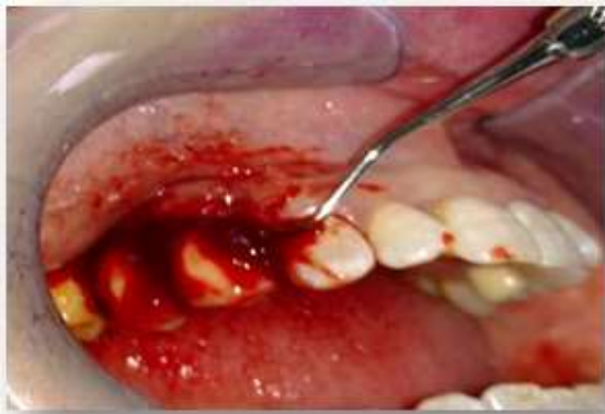
Fig-5.b: Mechanical debridement of the lesion with a curette