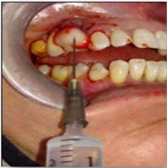
Fig-6: Application of H2O2 (leave for 2 to 3 min)