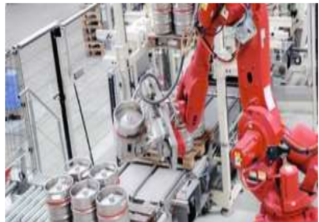
Figure 6: Automated industrial process in the brewing industry using ICT

They are widely used in the industry to control the activities of industrial processes, helping to a great extent to detect weaknesses and strengths at each stage of the process to increase productivity and quality levels, based on the reinforcement of automated systems controlled by computerized teams that train ICT. These automated control systems include cybernetic, electronic, electromechanical and electropneumatic devices widely used in industrial processes in any industry (Loza A et al. , 2009). Figure 6 illustrates an automated system used in an industrial process in a brewing industry.