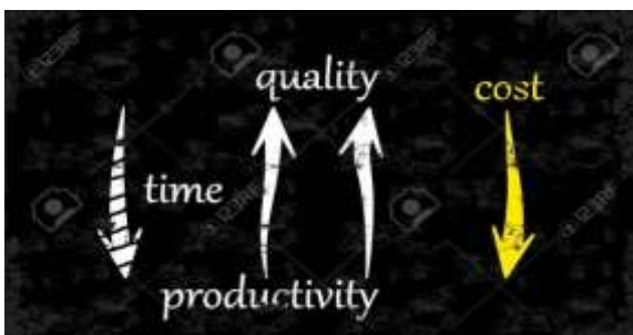
Figure 4: Balance of costs and benefits associating productivity and quality in industries

It is an important factor of the industries that has a great relationship between these terms and with the production processes where economic gains or losses can be determined. Productivity is considered an economic measurement action, managing to calculate goods (products manufactured in industrial companies) and services (activities that are offered by companies that provide services to consumers). Figure 4 represents the balance factor of costs and benefits in industrial companies, where productivity and costs are involved for a better understanding of this relevant relationship (Marin J et al. , 2009).