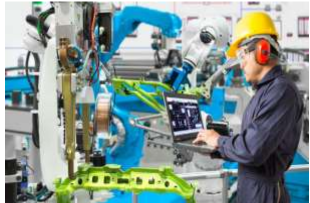
Figure 5: Uses of ICT in industrial processes

system), forming together the so-called Information and Communication Technologies (ICT). Figure 5 shows how ICT interacts with industrial processes in various types of industries.