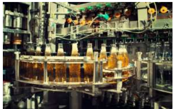
Figure 3: Industrial process of a brewing company similar to that of the industry where the research was made

It is a relevant type of industry in the countries where it is developed, being an important factor in the Gross Domestic Product (GDP), due to its large amount of demand for manufactured products and the enormous generation of sales, as it is a product consumed by various social classes. In the Republic of Mexico there are two main global brand companies, being Grupo Modelo and Grupo Heineken Mexico (previously called Cervecería Cuauhtémoc Moctezuma), and others on a smaller scale with respect to the amount of products manufactured and sales (ACERMEX, 2019). In addition, Craft beer production companies are included, such as the company, where this research was carried out, which is located in the city of Ensenada, Baja California, in the northwest of the Mexican Republic. Figure 3 shows an industrial process of brewing beer.