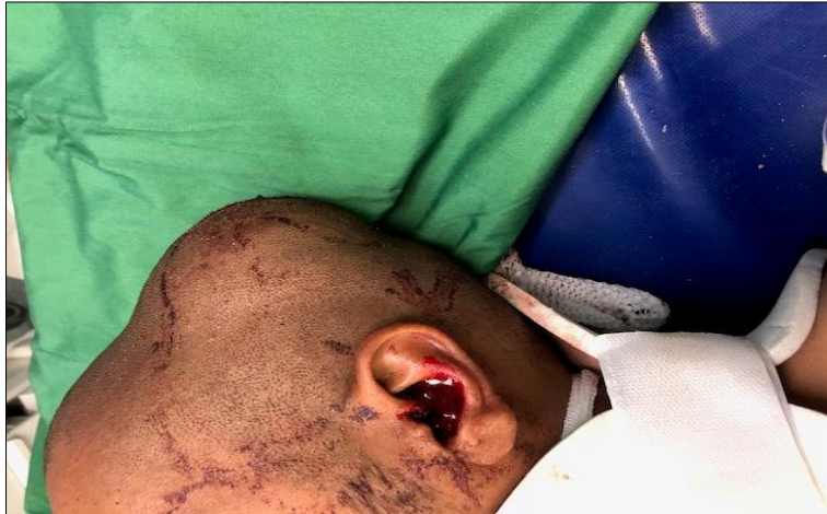
Figure 1: First exam of patient

We start the examination and did chest x-rays and FAST for him those were normal and we send her to do brain CT: